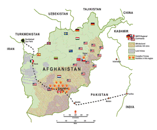
Proposed TAPI Gas Pipe Line

It is mainly due to future energy requirements and strategic positioning that has compelled India for its recent diplomatic push into Central Asia. India is planning to import gas from Turkmenistan via TAPI; it's named after the initials of four participating countries (Turkmenistan, Afghanistan, Pakistan and India). This is very uncertain and in case if India gets the long term supply of gas than it would need to go through with Afghanistan and Pakistan. There is disagreement on how much gas the country actually holds. "According to the BP Statistical Review 2009, Turkmenistan has the world's fourth largest reserves of natural gas, 7.94 trillion cubic meters (TCM), exceeded only by Russia, Iran and Qatar. Turkmenistan's 2009 ranking represents a sharp upgrade from 2008 (2.43 TCM). The new estimate follows the 2008 audit of the huge South Yolotan-Osman field in western Turkmenistan, conducted by the UK auditing firm Gaffney, Cline & Associates. The audit estimated the reserves of this field alone to be between 4 and 14 TCM of gas, making it the world's fourth or fifth largest field" (Foster, 2010).