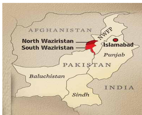
Figure 1: Location of Waziristan

Located in the Northwest Frontier Province of Pakistan (Figure 1), Waziristan is a mountainous area. Called as “wilder than the Wild West” by the U.S. and President George W. Bush (White House, 2007), Waziristan is a lethal land where a conflict between the U.S. backed Government of Pakistan and sadistic’s who identify themselves as Taliban had occurred.