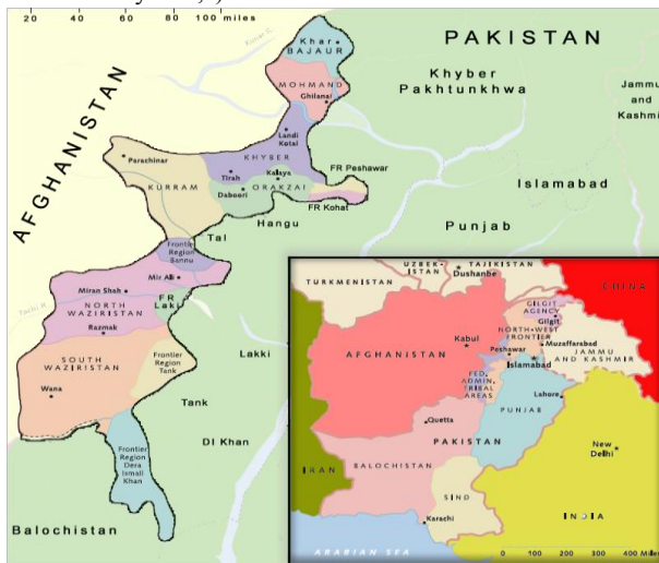
Figure 3 : Federally Administered Tribal Areas or Frontier Region

To add to the complication of the geography, Waziristan has not a well- distinct political borderline. A part of Pakistan Constitution under article 1, the territory of FATA is ruled under the orders of the President, who holds the executive ability and therefore, any state law, which has been drafted down and implemented is not appropriate and implemented to this area. Province. They have been allowed to follow and reconcile under their customary laws, which is ruled under the Frontier Crimes Regulation (FCR) of 1901. (FATA, “Administrative System,”)