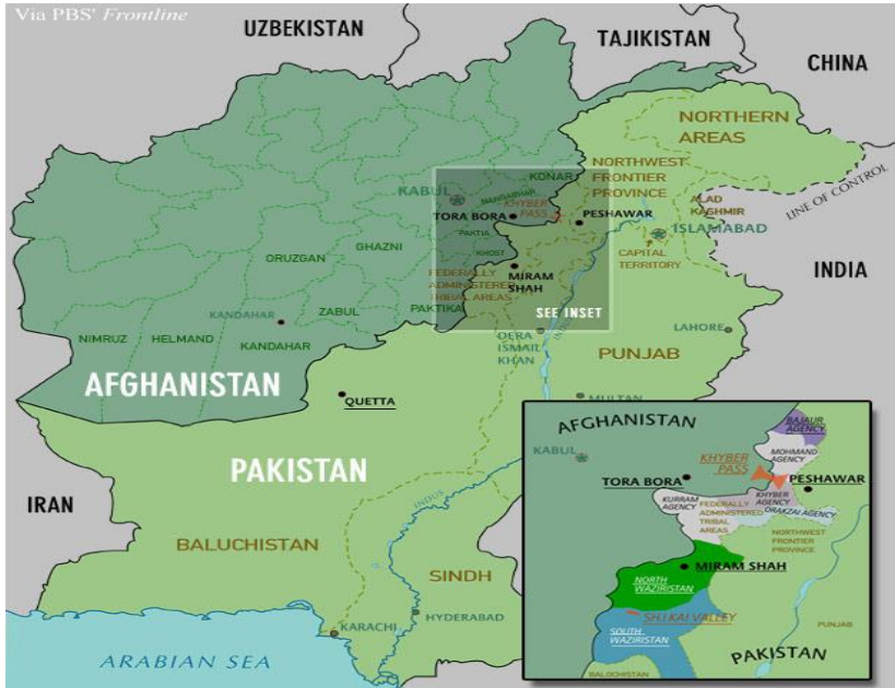
Figure 2 – Tribal Terrain’s of Pakistan

The largest outfit of FATA is South Waziristan; an area of 6, 620 square kilometers encompassing of mainly Mahsud and clans of Wazir. (Hassan, A, 2008). On the other divide is North Waziristan; an area of 4, 707 square kilometers. The agency is second largest of the area of FATA and there lies the tribes of Wazir and Dawar. (Details of the region –Figure 2)