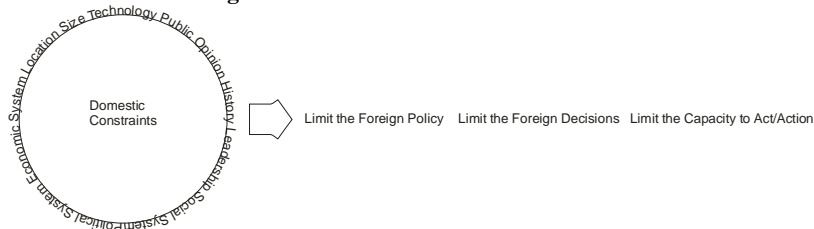
Fig. 1.3 Domestic Constraints

In the light of the whole discussion an effort has been made to formulate a theoretical frame work for the present study. Each of the various constraints blends into others that sandwich it. There are number of connections between government and social system, which play its role in the development and execution of foreign policy.