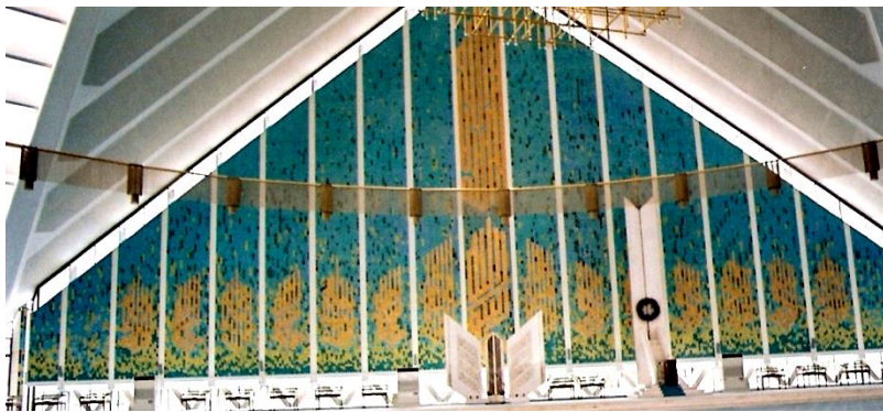
Figure 2. Western wall of the Faisal Mosque Islamabad.

Multi-coloured glazed ceramic tiles dominate the white of the entire ornamentations of the sanctuary, such as the tile mosaic work of the west wall and polychrome tile friezes on other three walls, blue and white of the carpet give attractive and rich impression to the entire composition. Touches of contrast colours help to discontinue the monotony of white colour, which evolved aesthetics of the entire ambiance.