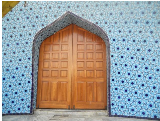
Figure 5. Western wall in the sanctuary of Ali Hajvery Data Darbar Mosque Lahore.