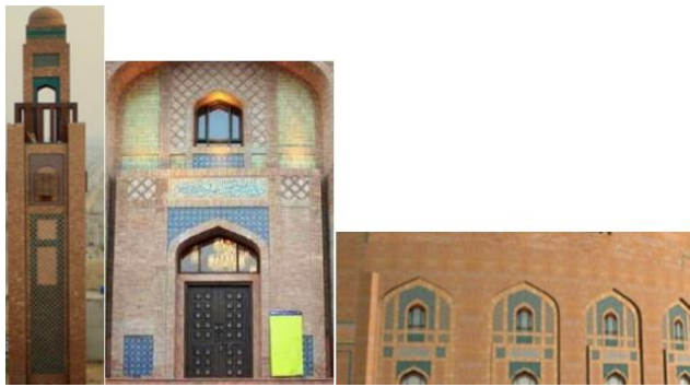
Figure 8. Tile Mosaic Work of Bahria Town Mosque Lahore built in 2014.

Historically speaking in Muslim architecture friezes of turquoise glazed tiles with terracotta tiles were first used by Iranian Seljuks for the ornamentation of the exterior walls of their monument. “The Arabs adopted this traditional art from Iran and used it later to embellish their buildings while spreading it all over the Islamic world” (Gulzar, 2016). The art of glazes was adopted for the ornamentation of South Asian Islamic architecture and the Mughals were the first one who embellished their architectural surfaces with rhythmic combination of glazed tile decoration with variation of design motives. In Bahria Mosque Lahore, decoration with Kashi technique is revived and became an essential component of architectural decoration of the mosque of its own kind.