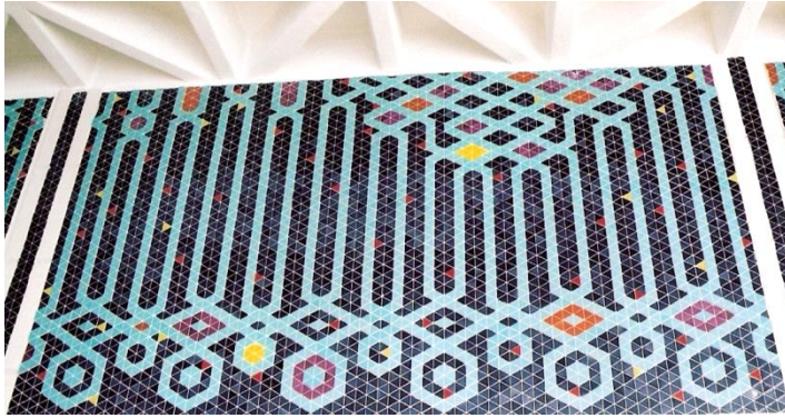
Figure 1. Tile design in the abluion area of the Faisal Mosque Islamabad.

In the abluion area and its staircases, geometry is applied sophisticatedly with the height of complexity. These patterns symbolize the Islamic concern with continuous symmetrical creation of design patterns with a strong harmonious and careful composition of rectilinear geometry based on vertical, horizontal, and diagonal appearance. A rhythmic sequence is created with the name of Allah written in pseudo knotted Kūfic calligraphy in cobalt and cerulean blue tiles. Tile embellishment in the abluion area of the Faisal Mosque has beauty through colour harmony, complexity of design and line.