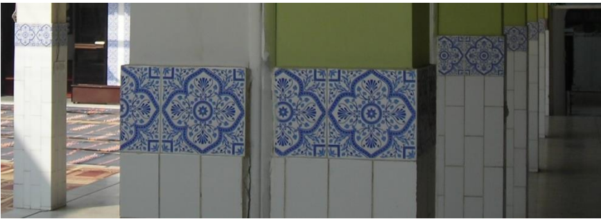
Figure 3. Interior of the Jami' Mosque Defence Housing Authority (Phase I), Lahore.

upper cement surface is painted green with white. In each tile central stylized flower has arch like four petals like star with complex floral design in and around all of them like Iranian star shaped floral motives. But here two lines at all four corners mark 90° angle make square with the attachment of four tiles, which make it composite tile design. Its over all composition has similarities with ceramic tiles with octagonal star designs on the piers of the Shaukat Khanam Mosque, Lahore 1994. But in Defence Mosque, stylized motives in simple appearance have no match with historical tile designs. Their royal blue and white colour with the presence of white flat rectangular tiles and pastel chrome green emulation all are giving harmonious impression collectively.