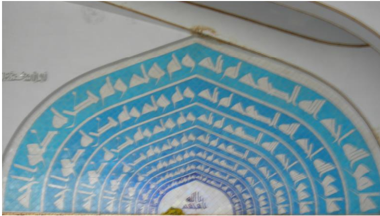
Figure 4. Western wall in the sanctuary of Ali Hajvery Data Darbar Mosque Lahore.

arches. It is western Kufic script, as used at Qairuwan, in Tunisia, in the early eleventh century.