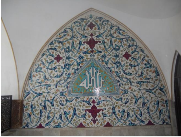
Figure 6. Women's Gallery wall in the sanctuary of Ali Hajvery Data Darbar Mosque Lahore.

In the Roman period mosaic work was based on the appropriate arrangement of tiny fragments (tesserae) of any hard substance. In this mosaic style, tiles were cut into small pieces, but in the Data Darbar Mosque the size of tesseras is larger, about the size of pieces remaining on the famous picture wall of the Lahore Fort. In the Women's Galleries of the mosque, the upper part of every arch is embellished with floriated composite tiles in Kashi Kari as are the walls on the eastern and western ends of the galleries. The large arabesques murals are in sea green, white, blue, ochre, orange and red and dominate the area. The design is based on traditional Islamic motive having islimi 2 characteristics. Islimi was originated in the ninth century under the Abbasids, and is first seen at Samarra in stucco work. The design as applied to the Women's Galleries at the Data Darbar Mosque is composed with elongated split leaves in small and large size that sometimes bear other smaller leaves of the same shape in a different colour. The leaves are attached to curling vines. There are also kidney-shaped leaves resembling the Kashmiri boteh (paisley) that are overlapped by a stylized floral shape. There is a second layer of design on the Data Darbar tiles, of thinner vines bearing rosette-type flowers. It entered the Islamic world from China with the Mongols in the thirteenth. The synthesis of the two designs took place in Iran in the fifteenth century (Timurid period).