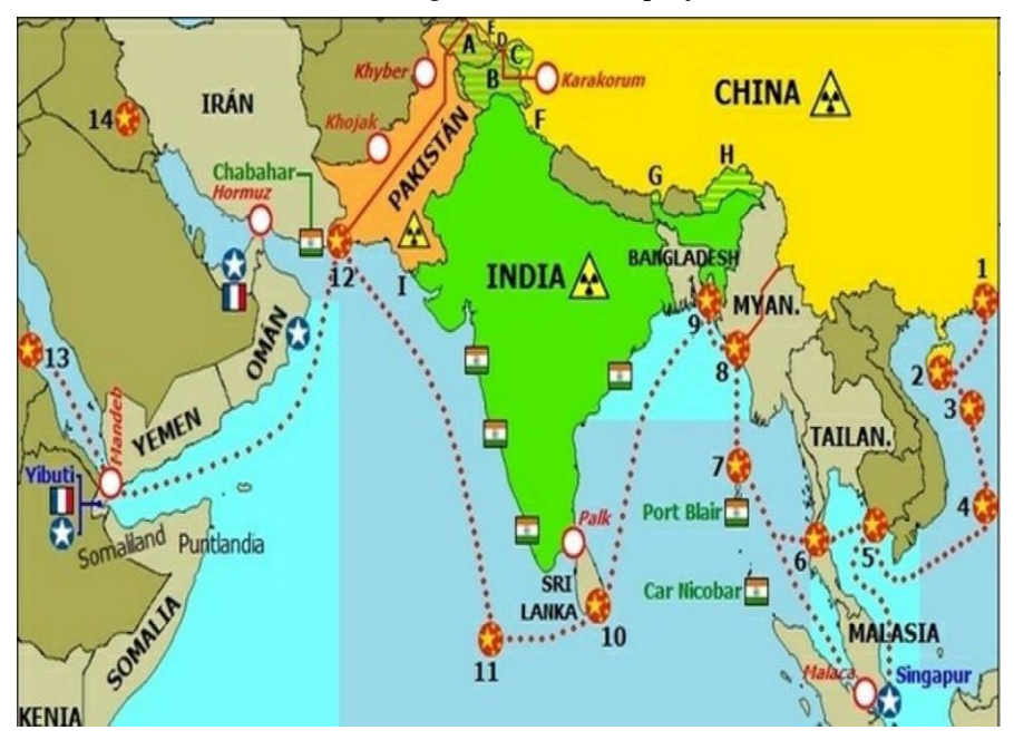
BRI & CPEC: Strategic & Economic Depth for Pakistan