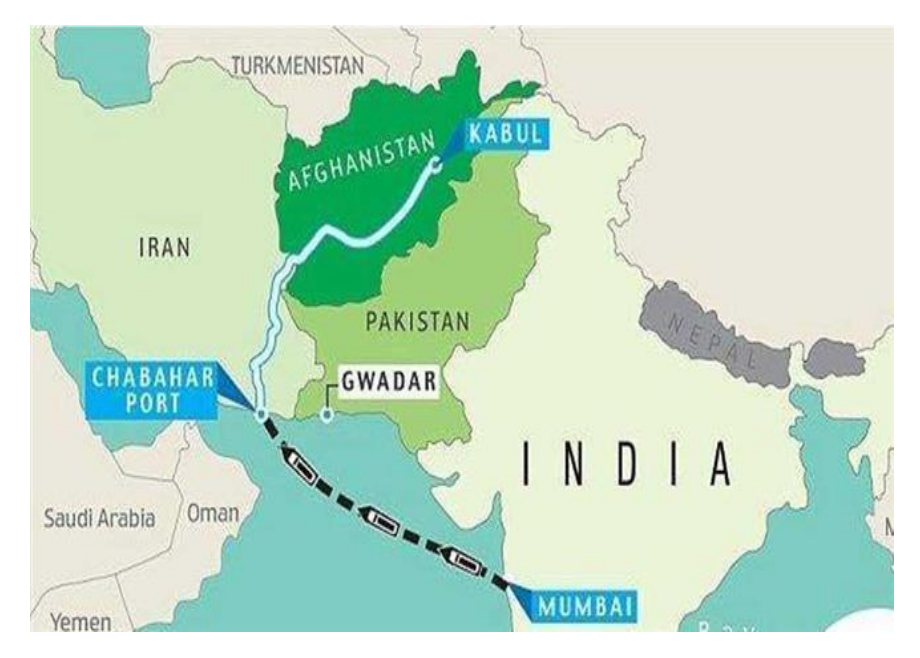
Map courtesy: PressTv.com-2019

As stated by Taylor (2016), India is presently trying to counter China's expansionism in South Asia and pursuing its monetary and strategic pursuits through looking for a relationship with Iran that is facing the new sanctions imposed by Western powers. The approach of Delhi towards Teheran is evidenced through big Indian funding, accredited since May 2013, for the development of the industrial port of Chabahar – positioned within the Iranian province of Sistan and Baluchistan, in the front of the Gulf of Oman and best approximately one hundred and seventy kilometers from the Pakistani port of Gwadar. This initiative is a part of the wider infrastructure challenge – which entails India, Iran, and Afghanistan – aimed toward building the Chabahar-Zahedan Hajigak Railway (CZHR), which might link the Iranian port of Chabahar to the Hajigak mining website online, via the Iranian metropolis of Zahedan. The realization of this infrastructure venture and the improvement of the port of Chabahar are significant for India, due to the fact they would allow it to connect Iran and Afghanistan without delay, bypassing Pakistan, greater commonly, this photo suggests that India's strategic goals are: to become stronger and enlarge its affect Afghanistan; advantageous entry to the transit network in critical Asia; outsmart its rival Pakistan in its very own outside; counteract the approaching Chinese language upward push in South Asia (Taylor, 2016).