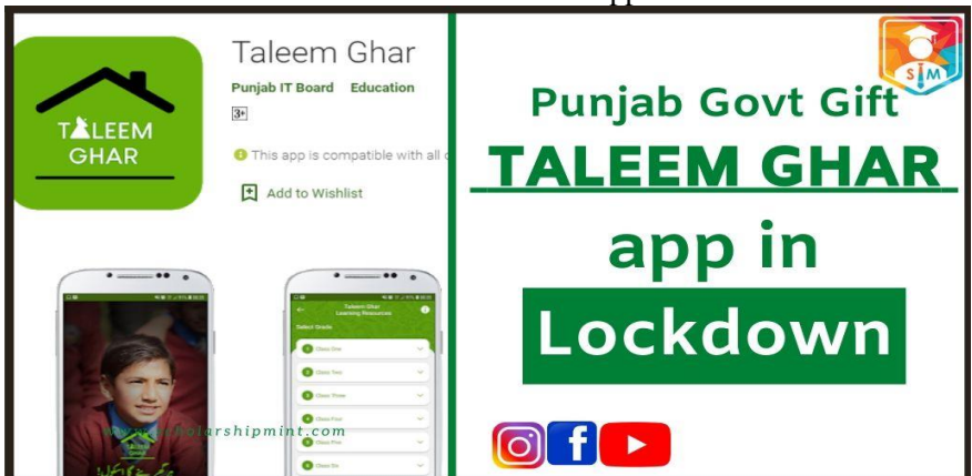
Figure.1: Pictorial view of Taleem Ghar App

The public and private schools were also closed during the Pandemic COVID-19. So, a great challenge has been faced by the Primary, Secondary and Higher secondary (K2) school's students. The Government of Pakistan has taken the steps to compensate the loss of these student by launching an application called as "Taleem Ghar". This application delivers recorded lectures of different classes including K2 in different times. It was the good initiative of Government of Pakistan. Now every student can watch the recorded lecture related to his class on this Application.