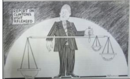
Cartoon 5. Published on April 20, 2000 (Dawn)