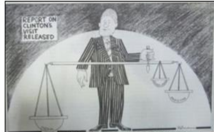
Cartoon 5. Published on April 20, 2000 (Dawn)