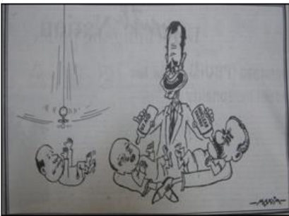
Cartoon 2. Published on September 27, 1991( The Nation )