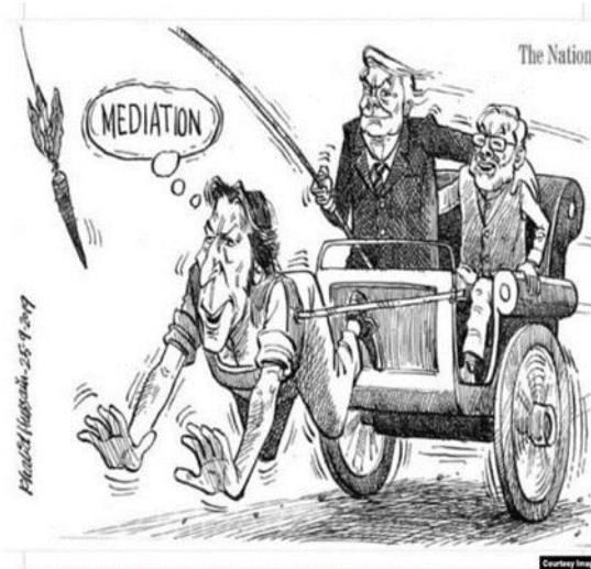
Cartoon 1. Published on September 25, 2019 (The Nation)

during his meeting on the sidelines of the U.N. General Assembly in New York on September 23, 2019. The tensions between India and Pakistan got escalated after India's revoking the special status of Kashmir under the Indian Constitution's Article 370 on August 5, 2019. Pakistan wanted the United States to mediate but India had always been rejecting the idea of mediation and declared Kashmir issue as a bilateral matter between India and Pakistan. On the other side, the U.S. president Donald Trump also announced that Indian Prime Minister Narendra Modi had approached him to play his role as mediator for the dispute in the state (Hebber, 2019, August 6) regarding revocation of special status of Kashmir.