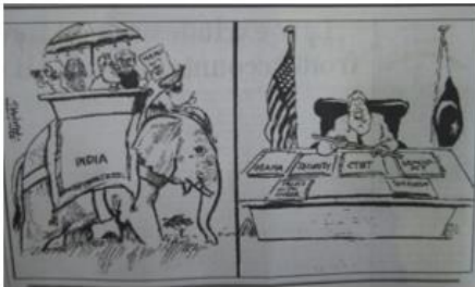
Cartoon 4. Published on March 21, 2000 (The News)