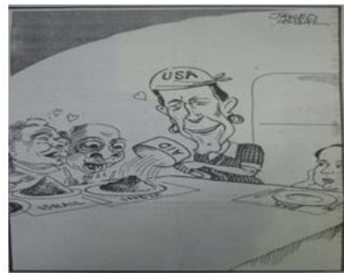
Cartoon 3 Published on February 01, 1991( The News )

During the presidency of George W. H. Bush, one of the significant issues of Pakistan-India- U.S. political ties was military assistance and the nuclear non-proliferation. Political cartoonists in Pakistan predominantly constructed the image of the U.S. president and Uncle Sam as an 'unjust' and 'unfair' in his dealings with two historical rivals i.e. Pakistan and India. Political cartoons in all three selected newspapers Dawn , The Nation and The News portrayed the relationships of all three countries by using almost the same patterns of metaphors, signs and symbols. It was found that the Prime Ministers of Pakistan, India and Israel as the main signifiers