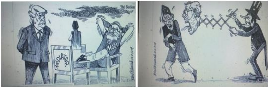
Cartoon 11. Published on September 2, 2016 (The Nation) Cartoon 12. Published on October 9, 2016 (The Nation)

During the presidency of Donald Trump, a clear difference has been observed in the depiction of the triangular relationship in Pakistani political cartooning between PML (N)'s government and incumbent government of PTI. During PML (N)'s government, the similar nature of the representation of Pakistan-U.S.-India relationships was pre-dominantly found in political cartooning of Pakistan where President Donald Trump is either supporting India against Pakistan or playing at both sides in a hypocritical manner. This image was being depicted by using different metaphors. For instance, 2016 to 2018 was the period of the U.S.-India love affair where the United States made India its major defense partner in the region and signed and MOU for the exchange of advance Logistics with India. By the MOU, India got a license to use the U.S. military system to counter terrorism and China's growing influence in the region (Iqbal, 2016, August 30). According to several media reports and political analyses from Pakistan and the United States, this MOU with India would affect Pakistan badly in the region in all aspects because this would allow India to access the modern American weapons in Kashmir and also against Pakistan. In addition, the most important matter was the timing of signing this MOU because Pakistan was looking at the United States to mediate between India and Pakistan to Kashmir issue (Iqbal, 2016, August 30; Munir, 2016). Cartoon